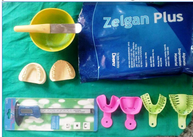
Fig 1: Arnamentarium

Once the patients were selected for the study, they were explained orally regarding the study and after their voluntary approval, a written consent was taken from all of them. The patient was seated comfortably and following aseptic conditions and wearing gloves, upper and lower jaw impressions were taken with alginate impression material using universal precautions for infection control. The study cast models of these impressions were prepared with dental stone and were used for analysis of odontometric values ( Fig 1 ).