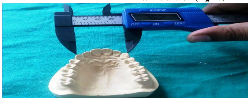
Fig 2 :Inter-canine distance in upper jaw

Finally all the 4 measurements of each of 50 subjects i.e maxillary inter-canine width, maxillary inter-molar width, mandibular inter-canine width and mandibular inter-molar width ( Fig 2-5 ).