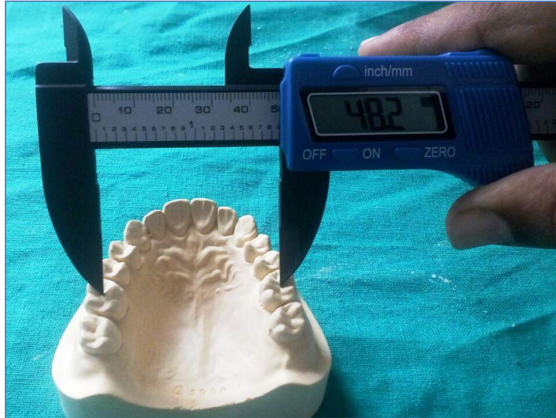
Fig 3: inter- molar distance in upper jaw