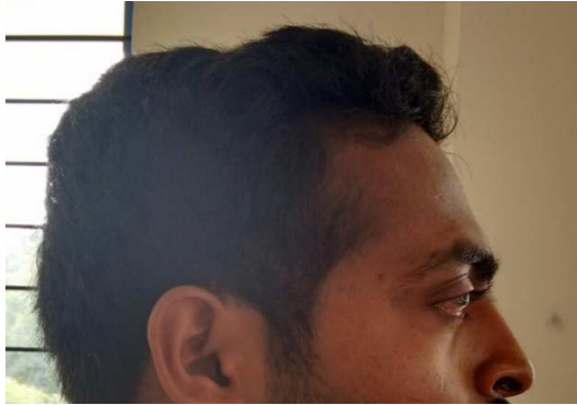
Figure 1: Proptosis in the patient