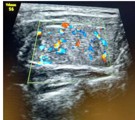
Figure 2: Thyroid scan and doppler showing thyromegaly and increased vascularity in the thyroid gland.