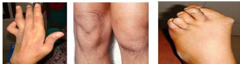
Fig 3: Inflammation in joints