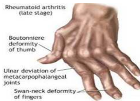
Fig 2: Symptoms of Rheumatoid arthritis