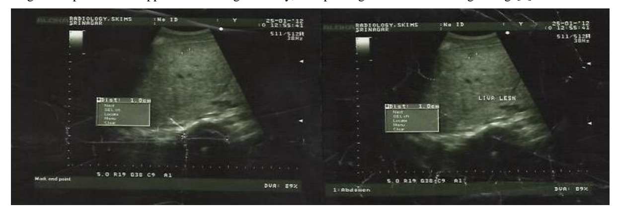
Fig 1: Ultrasonography of abdomen showing multiple hypoechoic lesions 1-2 cm in size in liver and spleen which was typical of type 3 pattern of hepatosplenic candidiasis

same was not seen in our case as lesions persisted throughout chemotherapy and disappeared after prolong duration of antifungal drugs[2].