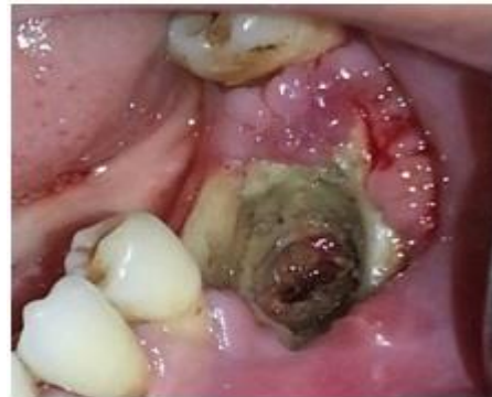
Fig 5 : Osteonecrosis focus in the left lower premolar region