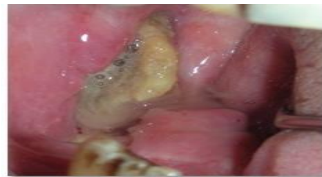
Fig 2 : Necrosis and bone infection