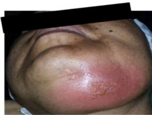
Fig 4 : Low cellulitis in relation with osteonecrosis