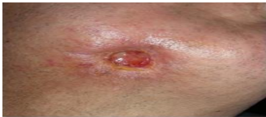
Fig 1: Cutaneous fistula in the right submandibular region

The management of these patients with bisphosphonate induced osteonecrosis of the jaws is quite challenging [2]. The major goal of treatment for patients who have osteonecrosis of the jaws is preservation of quality of life through: patient education and reassurance, control of pain, control of secondary infection and prevention of extension of lesion and development of new areas of necrosis [8]. However, in advanced cases, management of this complication is difficult and the recidivism is inevitable [8].