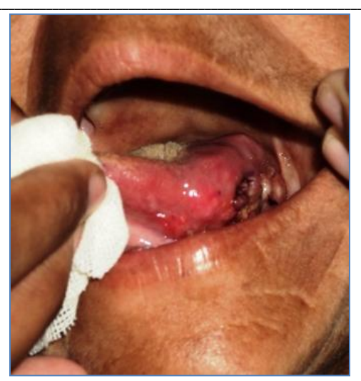
Fig 1: Intraoral view showing ulcerative lesion on lateral border of tongue

Based on the history and clinical findings a malignant ulcer was kept in mind and an incisional biopsy was carried out. Histopathological examination revealed a para-keratinised stratified squamous surface epithelium with dysplastic features like abnormal mitosis, individual cell keratinisation. There was loss in continuity of the epithelium at fewplaces and epithelium was seen invading into the connective tissue and keratin pearl formation was evident at many sites. The connective tissue showed few epithelial islands showing dysplastic features, surrounded by chronic inflammatory cells (Fig 2).