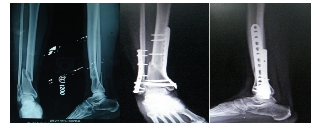
Fig. 1: Preop and post op xray of distal tibia fractures treated with biological plating