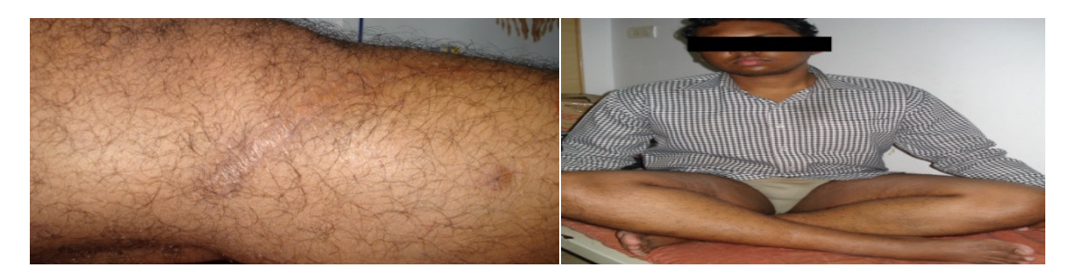
Fig 4 : Incision scar of biological plating done for proximal tibia fracture with full extension of knee And full flexion in cross legged position