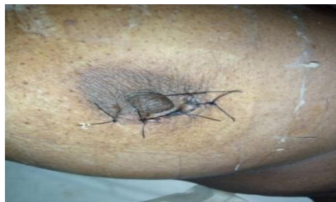
Figure 5: Stitched line after closer