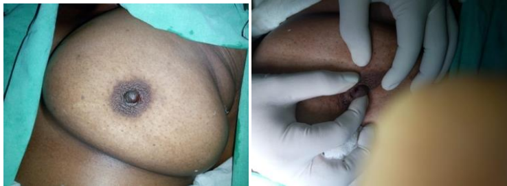
Figure 1,2: single asymptomatic subcutaneous nodules in the left breast for 2 years

This presentation of eumycetoma as coalescing, subcutaneous, breast nodules unaccompanied by any surface changes such as discharging sinuses in spite of disease lasting 4 years is distinctly unusual.