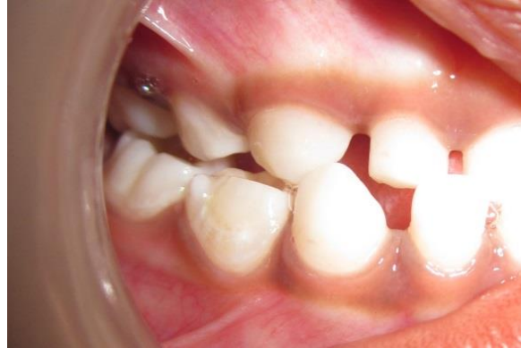
Figure no 2 (a) : right occlusal view showing posterior crossbites