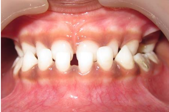
Figure 1: showing entire maxilla in cross bite

number 1 to 5 shows the treatment at different phases.