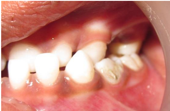
Figure 2 (b):left occlusal view showing posterior cross bite