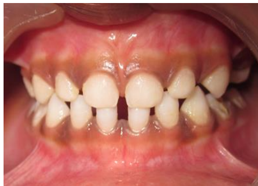
Figure 4: corrected cross bite