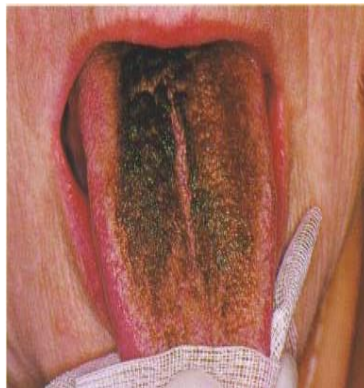
Fig 5:Hairy tongue