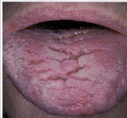
Fig 4:Fissured tongue