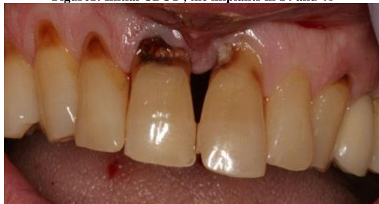
Figure2:Pre-op condition. Exposed metal margin and hopeless tooth