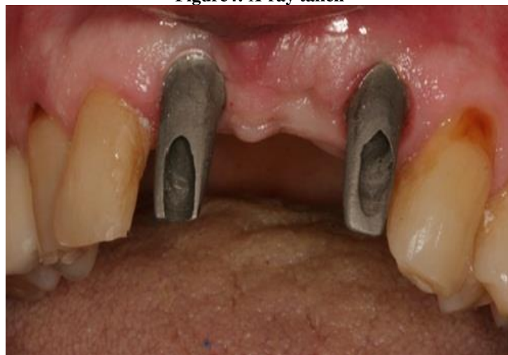
Figure5: Placement would not allow screw retained bridge UCLA cast on gold