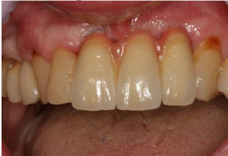
Figure7: Cement retained -----zinc phosphate.