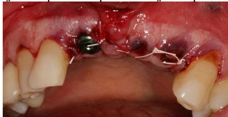
Figure3: Extraction and placement