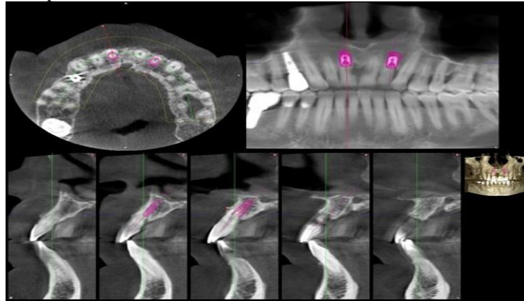
Figure1: Initial CBCT , the implants in 14 and 46

Phase II therapy was planned, extraction of teeth 12,11and 22 was done under local anaesthesia. Flap surgery has been done after the extraction of the mobile anterior teeth region(Figure2,3 ).