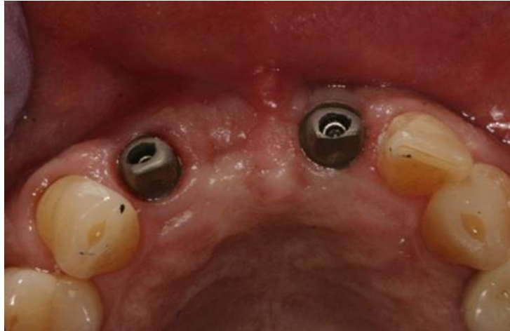
Figure6: Abutment in Situ