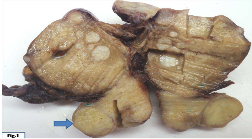
Fig. 1: Gross specimen showing a well circumscribed grey yellow tumor at cervix

with haemorrhagic material Left ovary and bilateral fallopian tubes were grossly unremarkable.