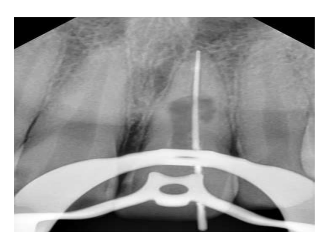
Figure 4: Working length determination

conservative access opening was done & the canal was negotiated with precurved no 10 K-File upto the apex. The coronal pulp was non-vital while the bleeding was induced on negotiation of middle third of the canal space. Coronal flaring of the canal was carried out by Gates–Glidden drills (sizes 3&4). The working length was established with an electronic apex locator (Root ZX-2 J-Morita, USA). Radiograph was taken to reconfirm the working length. [Fig 4]