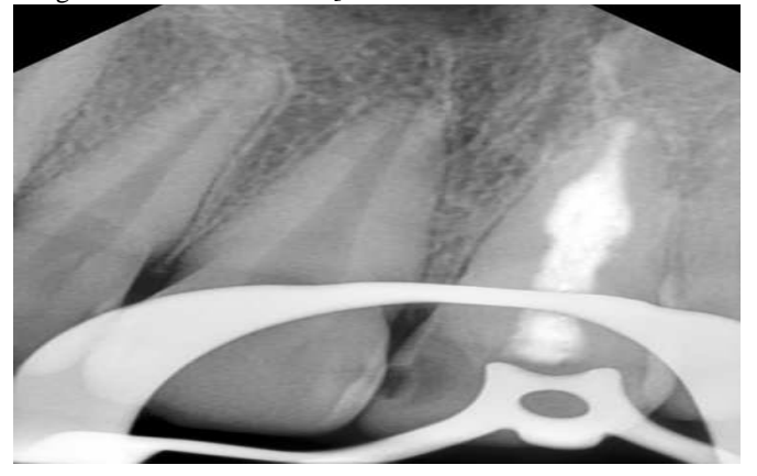
Figure 5: Placement of calcium hydroxide intracanal medicament in tooth #21.

EndoActivator ,Dentsply Maillefer] The master apical file was ISO 0.50. The canal was dried with paper points and calcium hydroxide [ Ca(OH)_2 ] intracanal medicament was placed in the canal. [Fig 5]