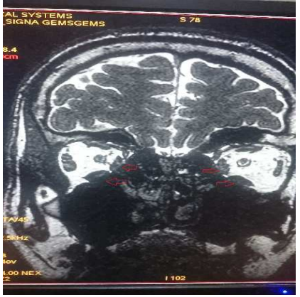
Figure 4: MRI skull and orbit showing hypertrophy of muscle belly of bilateral medial and inferior recti (sparing the tendons)

a severe form. Cigarette smoking is the strongest risk factor associated with thyroid ophthalmopathy [2]. Ocular manifestations include proptosis, lid retraction, chemosis and external ophthalmoplegia.Diplopia can be a troublesome symptom. Our patient hadno ocular symptom. Orbital imaging (USG, CT and MRI) is a very useful diagnostic tool. The three important features are - 1. Enlargement of muscle belly sparing the tendons (coke bottle appearance). Extra ocular muscles are involved in a predictable fashion - inferior rectus, medial rectus, superior rectus and lateral rectus in that order. 2. Increase in orbital fat volume. 3. Crowding of optic nerve at the apex. Our patient had tendon sparing hypertrophy of bilateral medial and inferior recti. It is a self-limiting disorder resolving within 2-5 years without any treatment. The treatment options are 1-