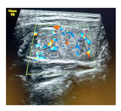
Figure 2: Thyroid scan and doppler showing thyromegaly and increased vascularity in the thyroid gland.

Thyroid associated ophthalmopathy is an autoimmune disorder characterised by enlargement of extra ocular muscles, increase in fatty and connective tissue in the orbit. The circulating antigens against TSH cross react with antigen in orbit causing infiltration by T cells, of cytokines increase release and mucopolysaccharides, collagen and orbital fat volume leading to proptosis which is usually bilateral. Our had proptosis. bilateral Thyroid ophthalmopathy is more common in females in the age group of 30 to 50 years of age. But in males it occurs in