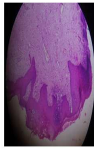
Fig 2: GCF histological picture under lower magnification