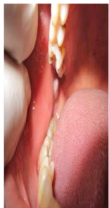
Fig 1: clinical picture showing giant cell fibroma